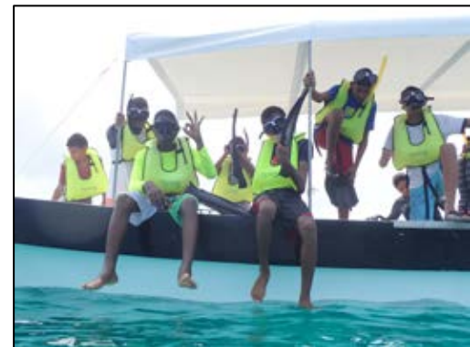
“Day as a Marine biologist” Students at a school of Roatán experience and interpret the coral reef system through snorkeling.